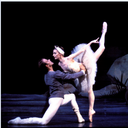
Preservation of the Classics