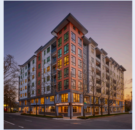
The Midtown Arts Center