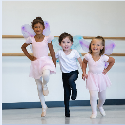
Eugene Ballet Academy