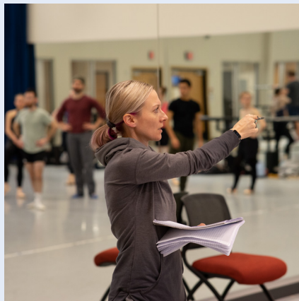
Creation of New Works