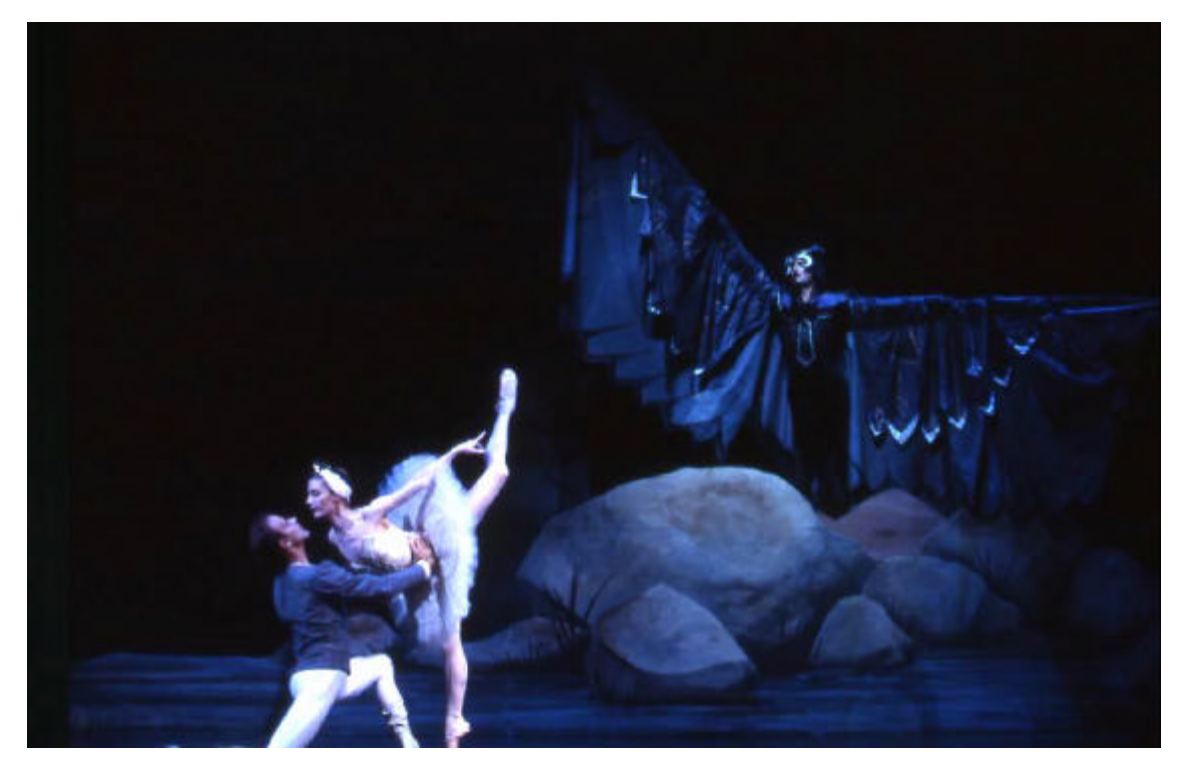
Above: Act II & IV Rothbart platform unit with attached painted rock scenery