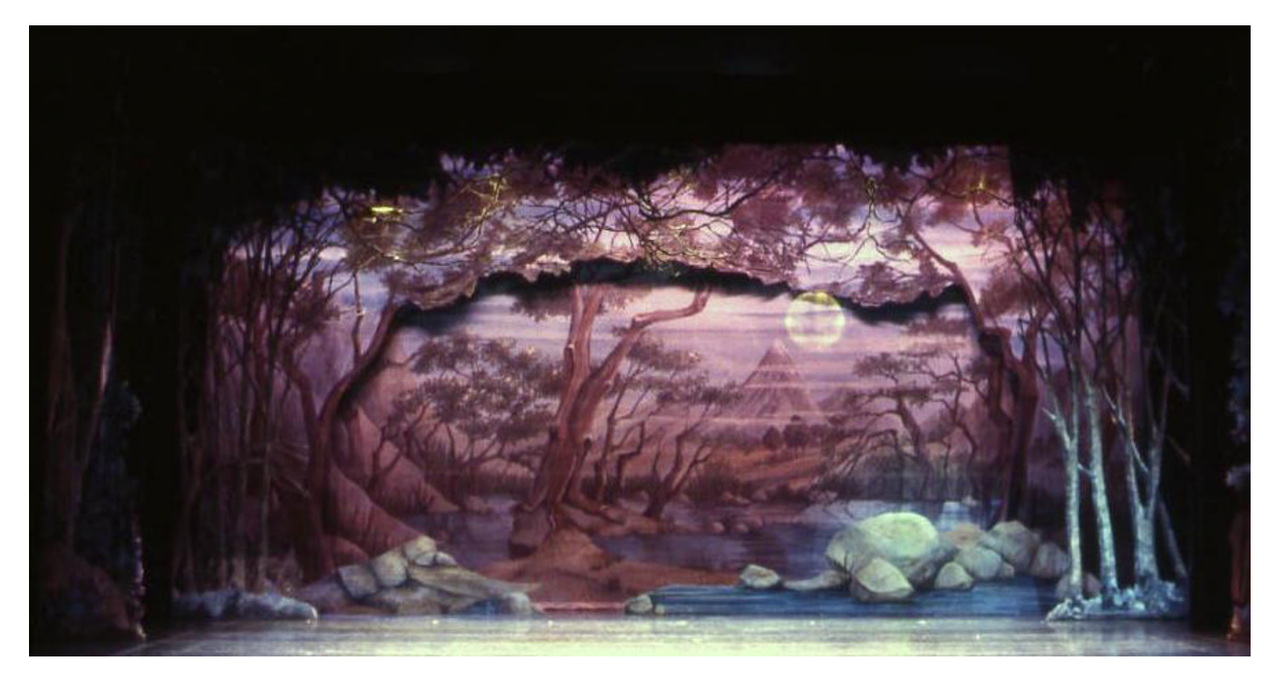
Above: Act II drop without stage lighting showing backdrop with outer tree border hung over the smaller lake backdrop for flexible use in stage houses. A moon box hangs behind the lake drop.