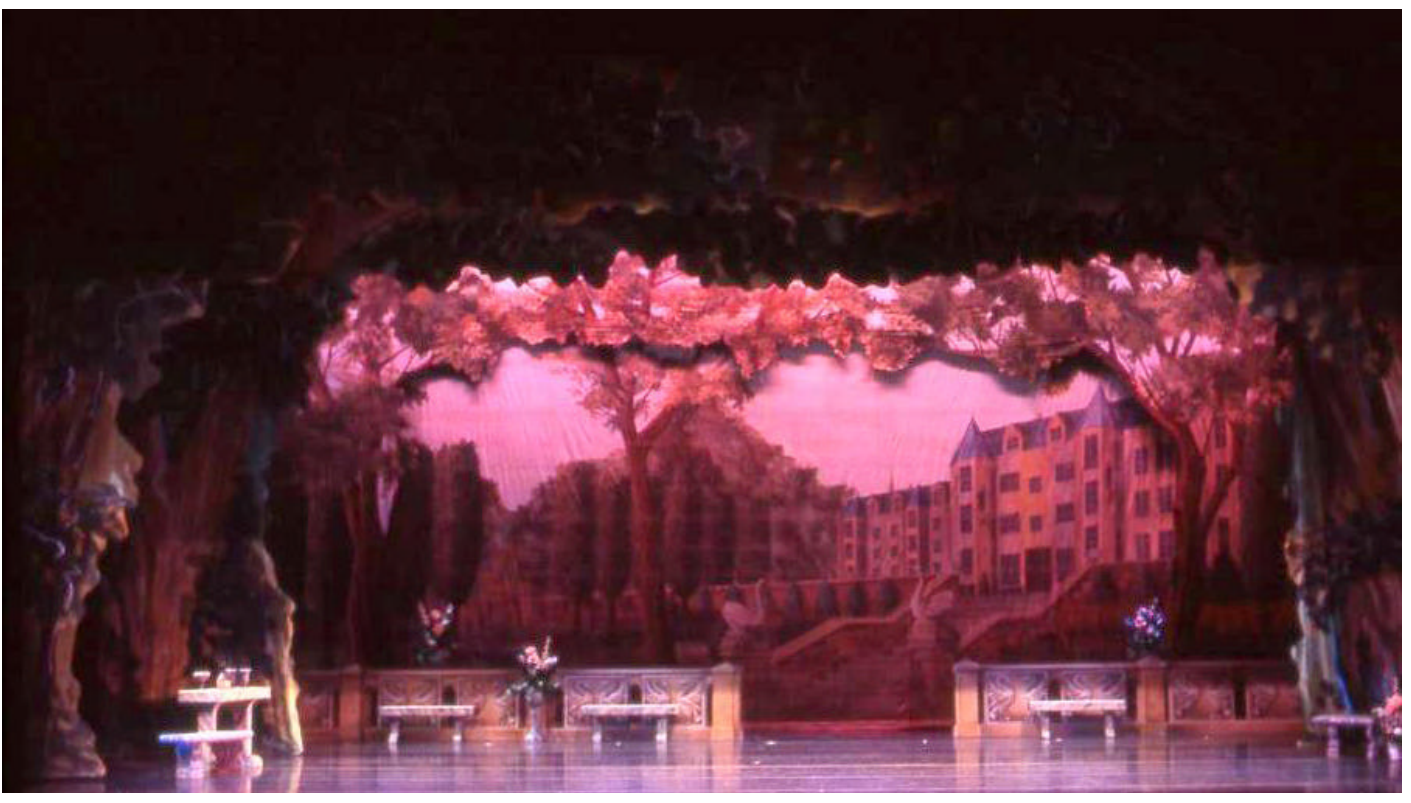
Above: Act I drop without stage lighting. Act I palace exterior backdrop is designed as an outer border hung over a smaller backdrop which makes the design more flexible for different stage house sizes.