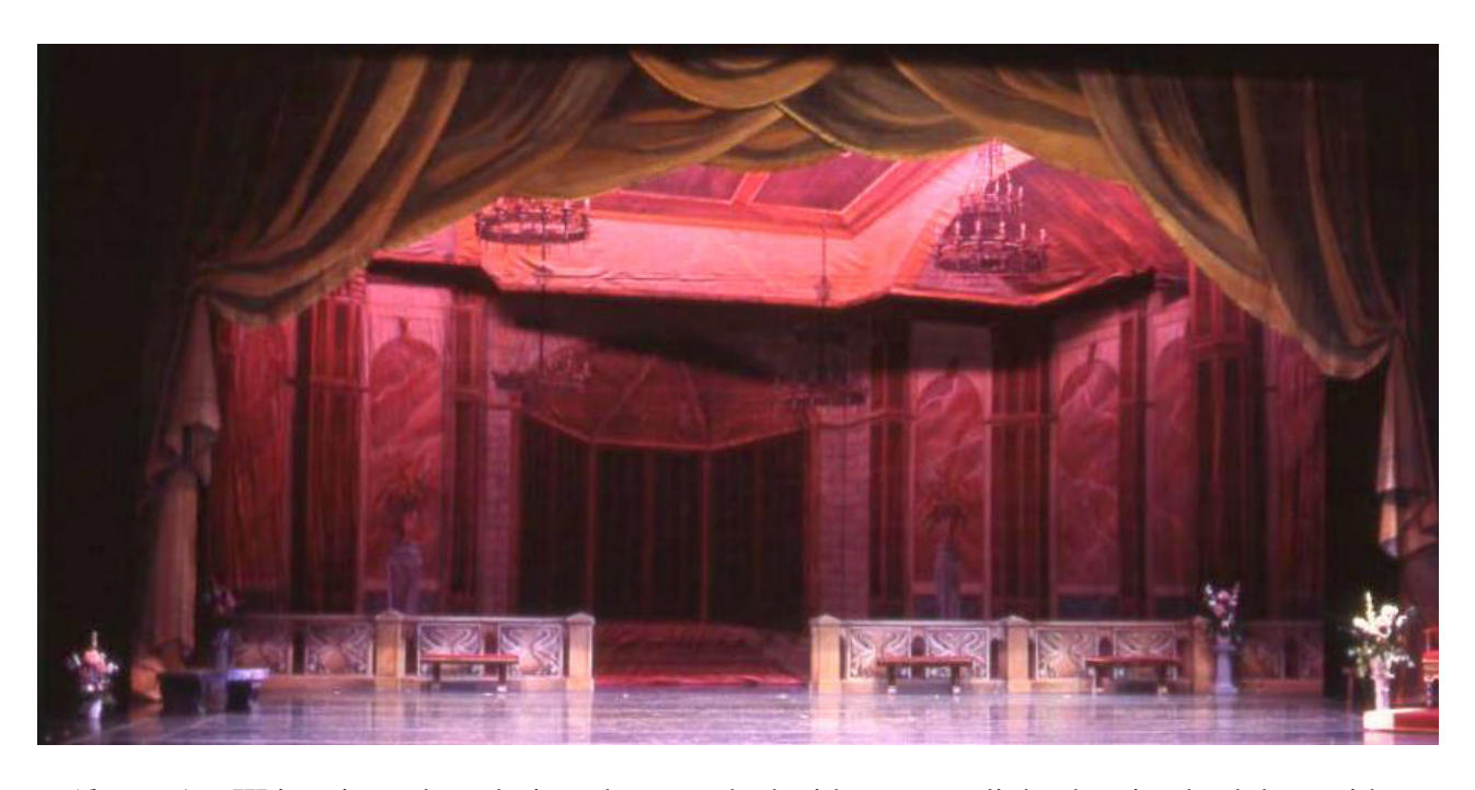
Above: Act III interior palace design photographed without stage light showing backdrop with outer palace ceiling border hung over the smaller palace window backdrop for flexible use in stage houses. The window is a painted scrim. The rolling unit used in the prologue and as part of Rothbart's rock unit is again used behind the window for Odette's reveal in Act III.