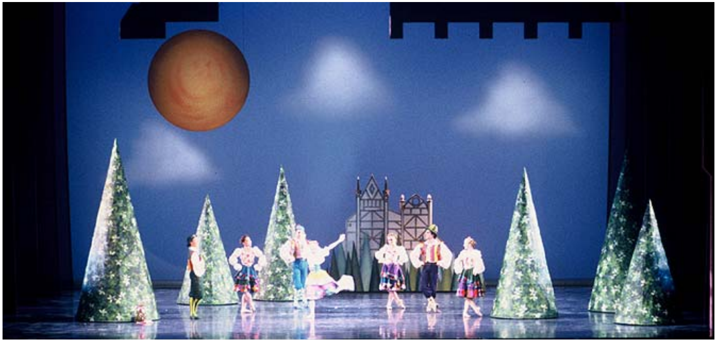
The Forest: 6 “trees” units on castors with hidden door Sun, up-stage small perspective castle, downstage castle cut-out border