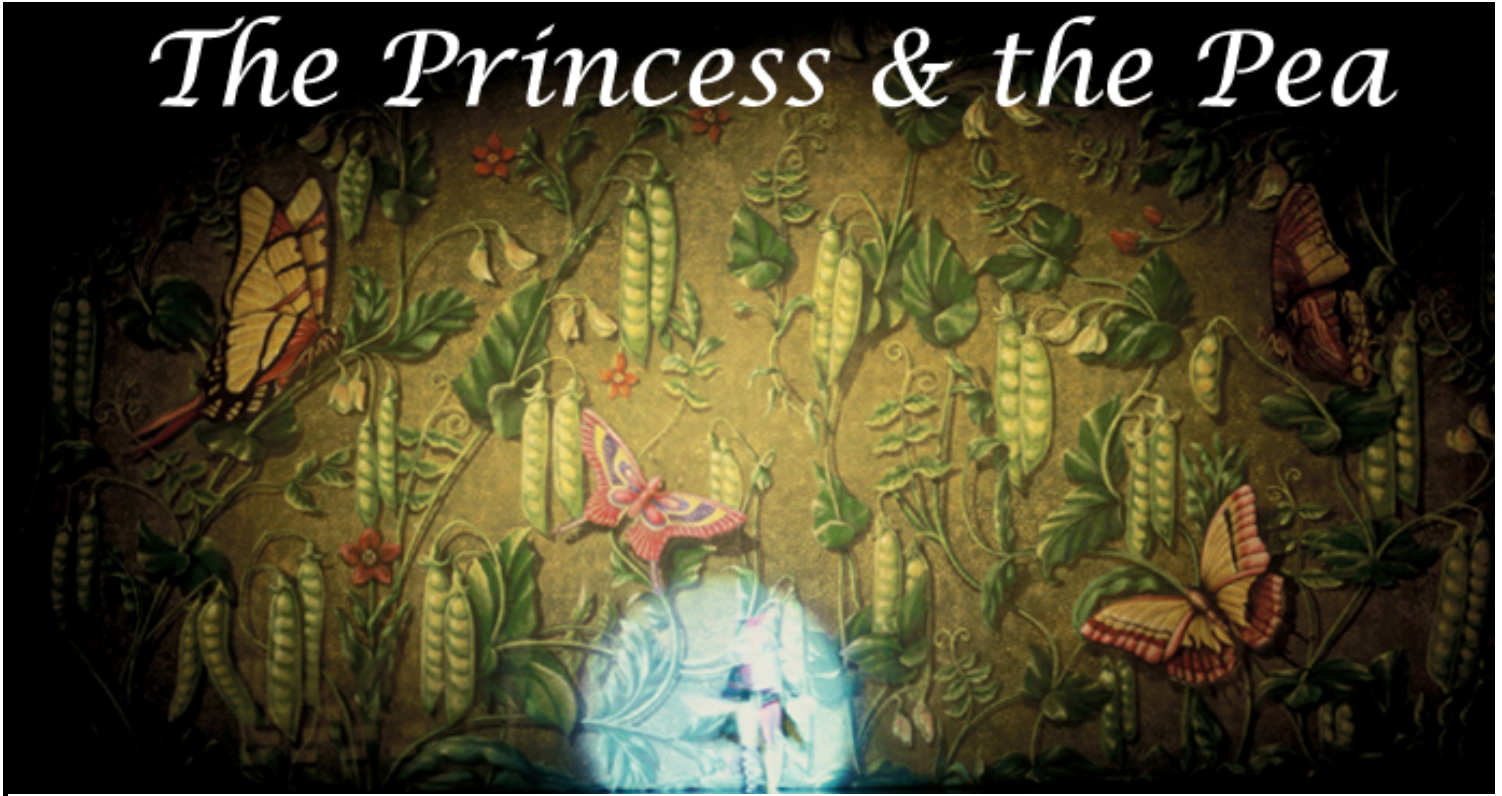
The Princess & the Pea - full size painted scrim of pea vines and butterflies (Jester down stage in spotlight gives indication of size)