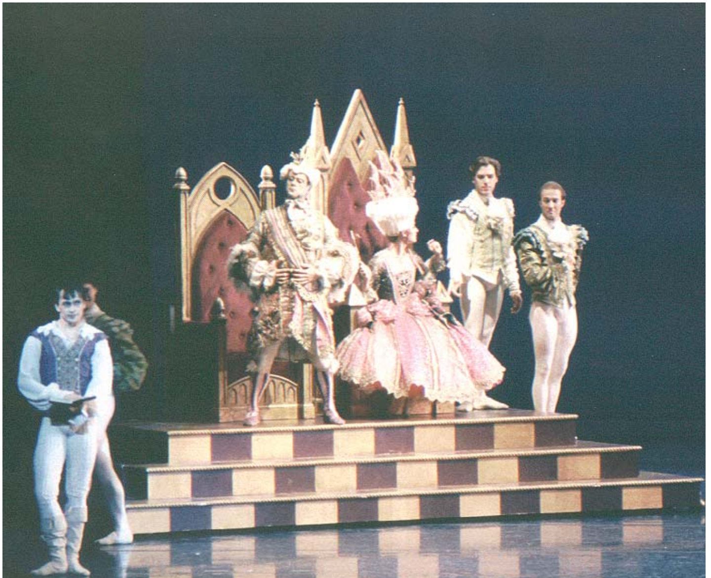
Throne - free standing unit on castors