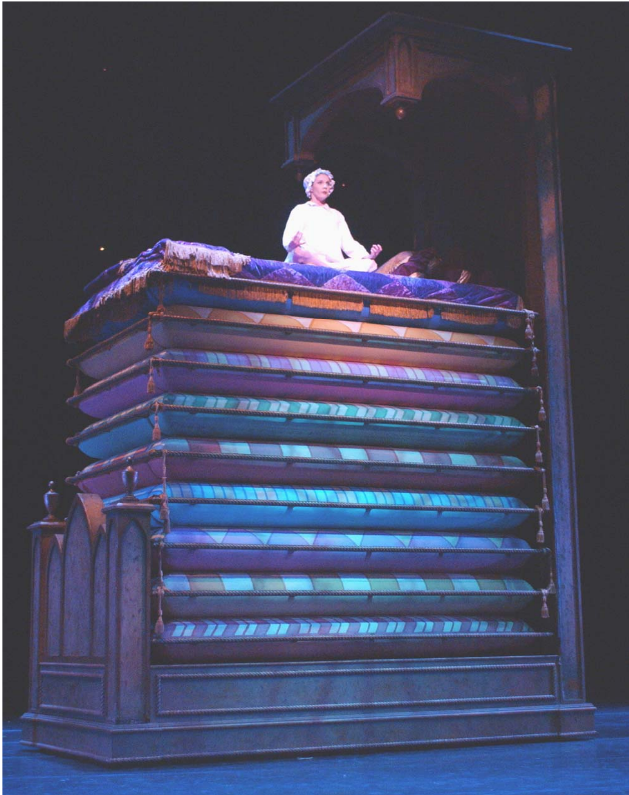
The princess's bed: free standing unit with castors, and ladder.