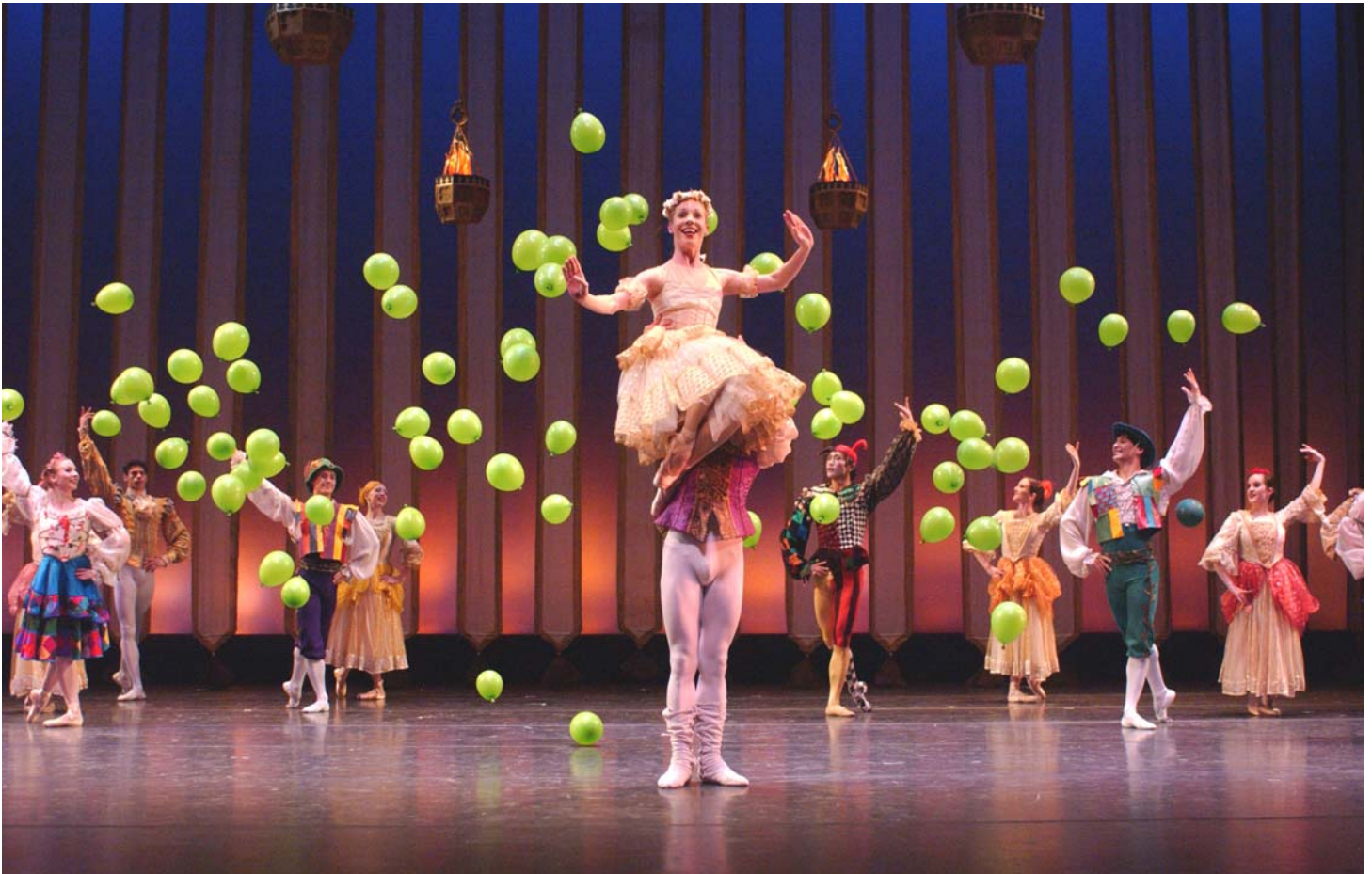
Ribbon Drop in front of cyclorama with torchieres