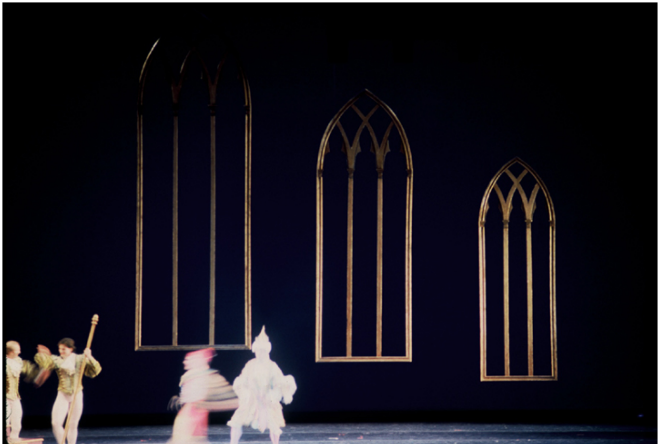
3 windows: 3 separate metal frames with gold paint