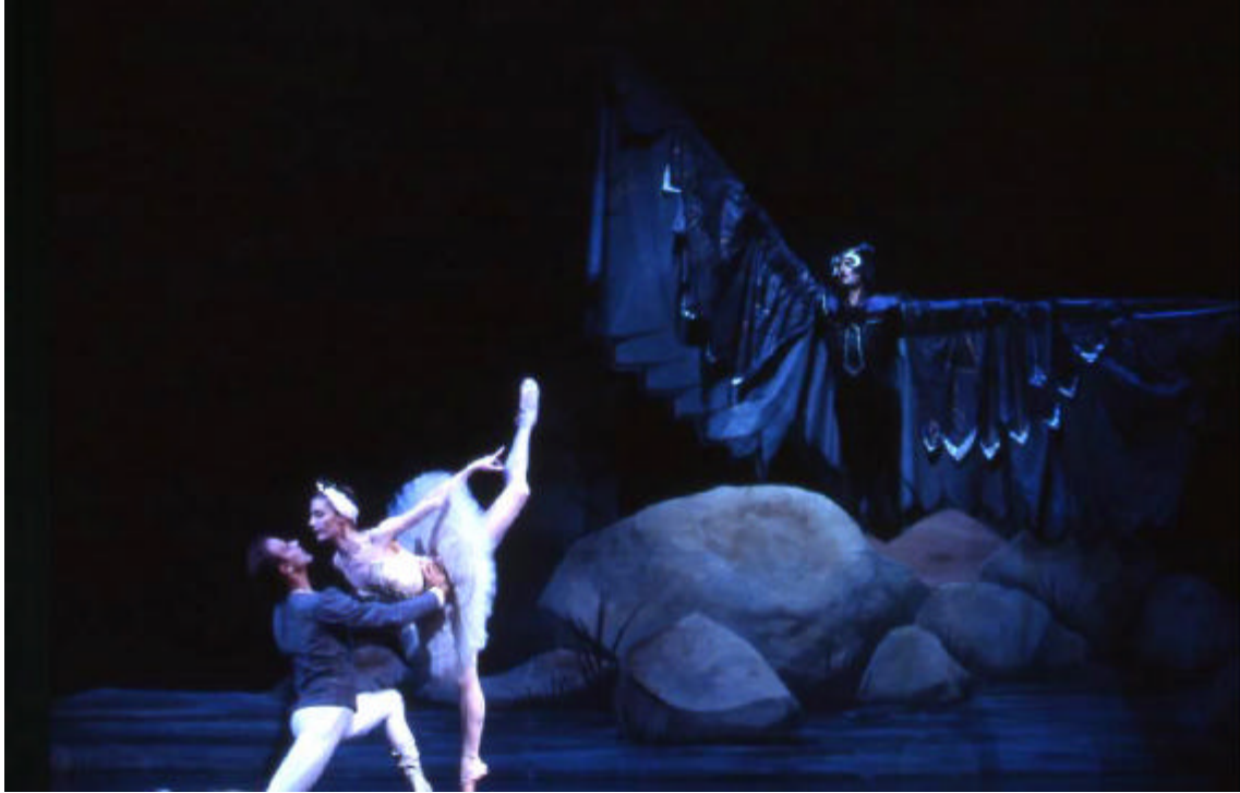
Above: Act II & IV Rothbart platform unit with attached painted rock scenery