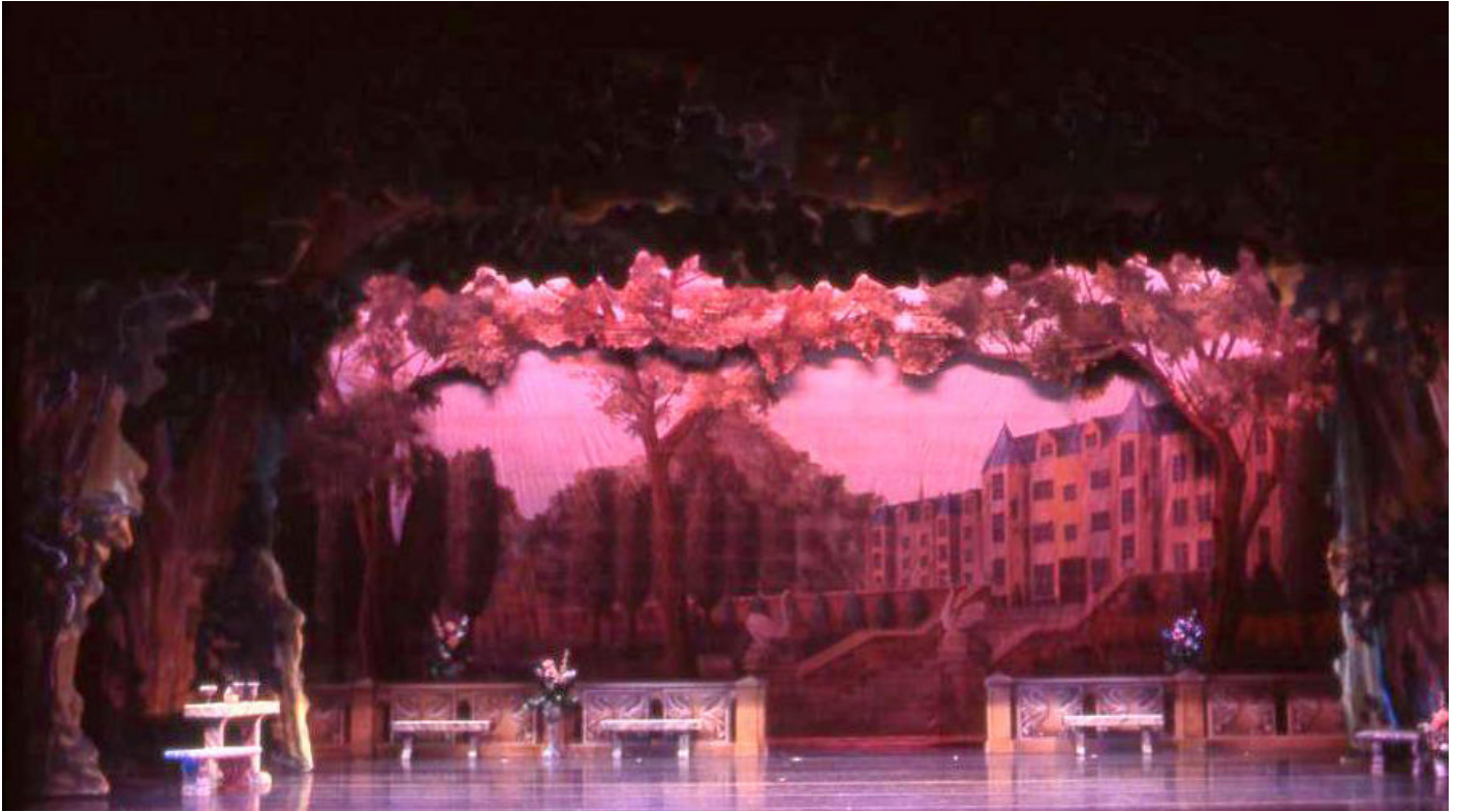
Above: Act I drop without stage lighting. Act I palace exterior backdrop is designed as an outer border hung over a smaller backdrop which makes the design more flexible for different stage house sizes.