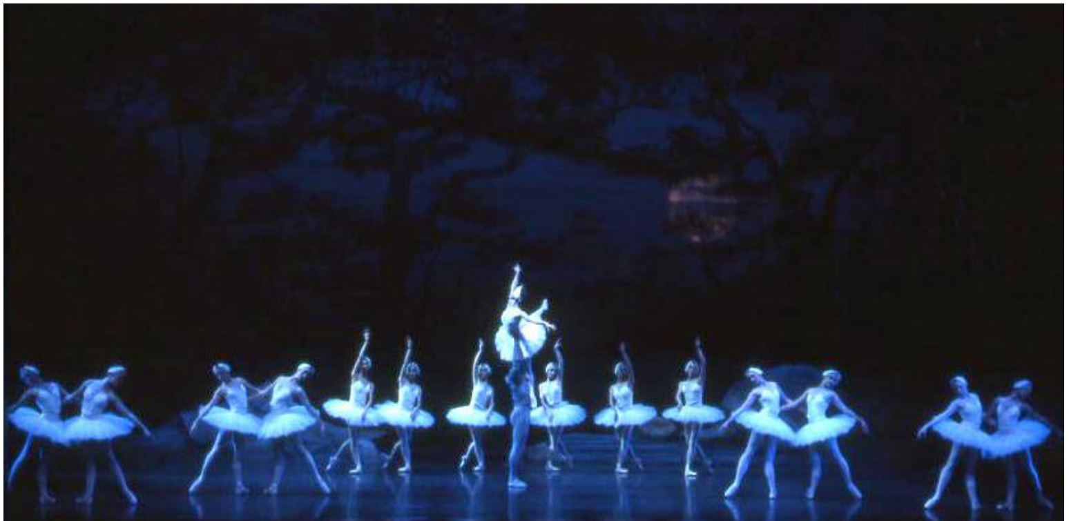
Below: Act II of Swan Lake in performance with stage lighting.