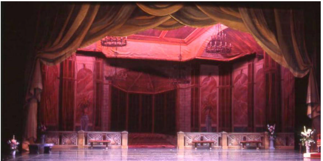
Above: Act III interior palace design photographed without stage light showing backdrop with outer palace ceiling border hung over the smaller palace window backdrop for flexible use in stage houses. The window is a painted scrim. The rolling unit used in the prologue and as part of Rothbart's rock unit is again used behind the window for Odette's reveal in Act III.