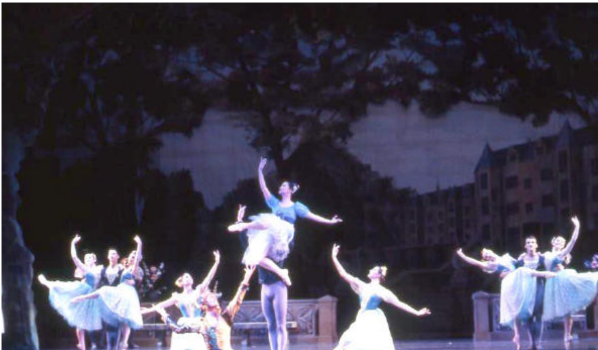
Above: Act I set design in performance with stage lighting